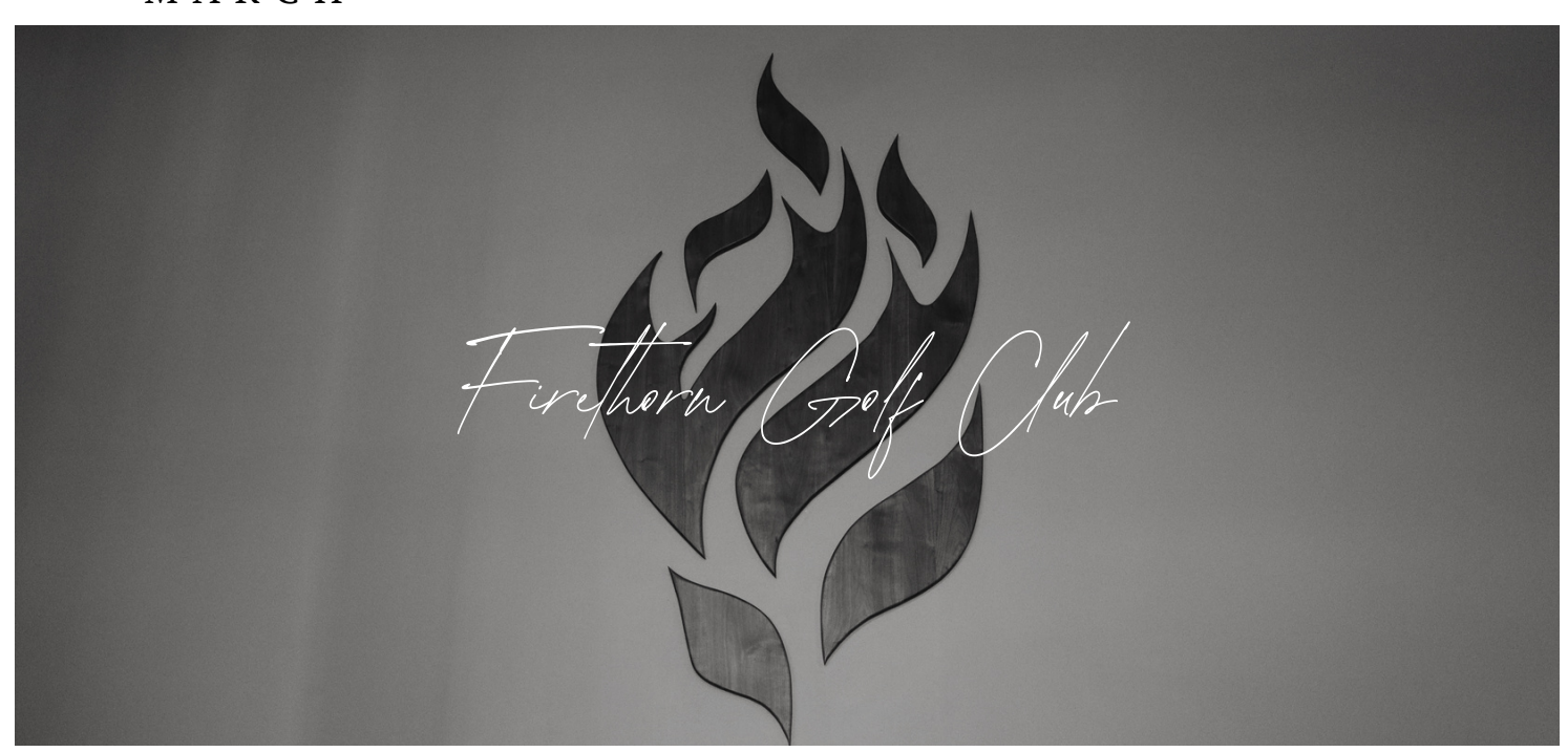
2 0 2 5